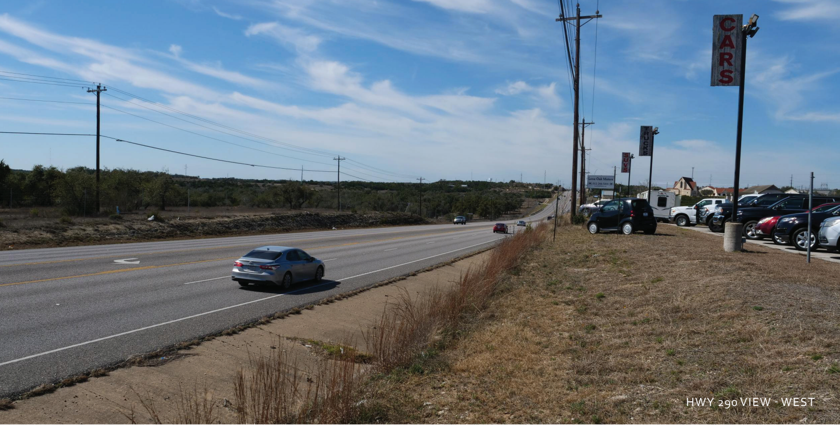
HWY 290 VIEW - WEST