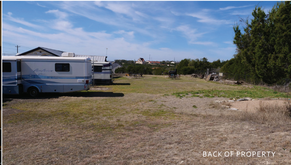
BACK OF PROPERTY