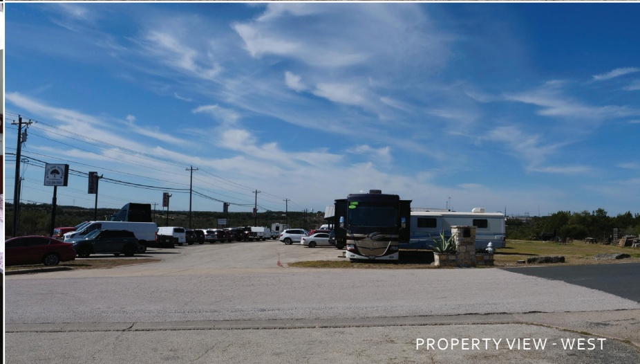
PROPERTY VIEW - WEST

CHRIS ODDO (512) 736-5933 oddo@toweratx.com